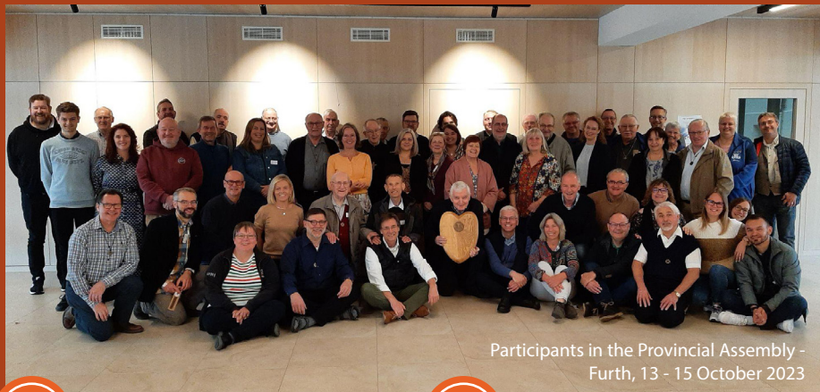
Participants in the Provincial Assembly - Furth, 13 - 15 October 2023

On Saturday 14th October, during the Marist Assembly of West-Central Europe held in Furth, Germany, our District was linked to the Province of L'Hermitage and officially inaugurated after time had been taken to celebrate the rich history of our Province over its 23 years of existence.