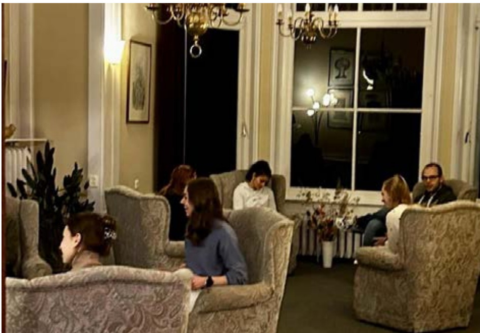
From the newsletter prepared by Ineke Tacq

A different perspective on conflict is not just a theoretical concept; it is an attitude to life that invites us to face conflicts with courage, understanding and compassion. If we collectively embrace this approach, we can create a world where conflicts are no longer feared, but seen as valuable opportunities for growth and connection.