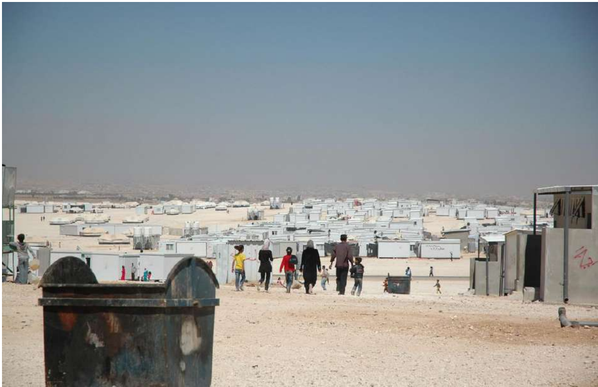
Za'atari refugee camp, Jordan

By mid 2013 approximately one million Syrian refugees had moved to Lebanon and Jordan, adding significantly to both countries' small populations and threatening their already strained public services and social order. Large numbers of refugees have also moved to Turkey, Iraq and countries beyond. However, this resource focuses on refugees' experiences in Lebanon and Jordan and contrasts the experiences of large numbers of these refugees; settling in host communities in Lebanon and moving to refugee camps in Jordan.