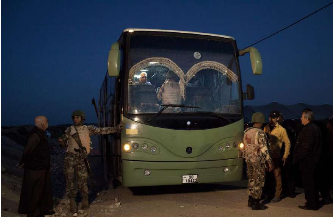
Refugees arriving at Syria's border with Jordan are bussed to Za'atari camp