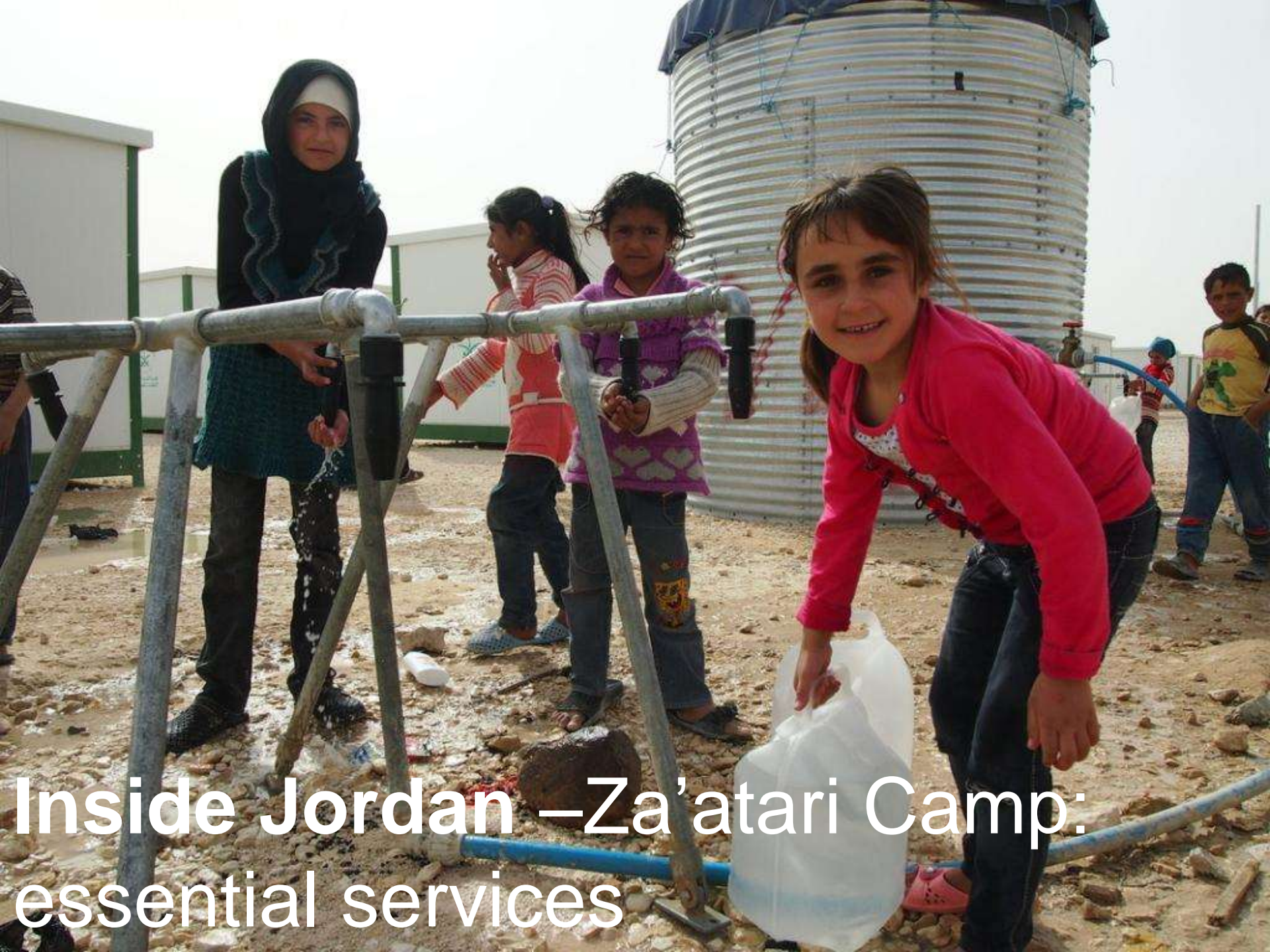
Inside Jordan – Za'atari Camp: essential services